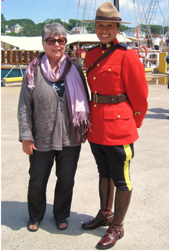
Me (in custody) at the Tall Ship Festival on Cape Breton Island

I continue to work ½ time (supposedly) for the Occasional Teacher Union as Vice-president. Our President was elected to the Provincial Executive of the Teachers' Union which includes a ½ time position on the Ontario Teachers' Federation so she is away from the office more than last year. This splits a lot of the work between the First VP and me. The bottom line is I'm losing the struggle to work only 3 days a week. But I keep trying.