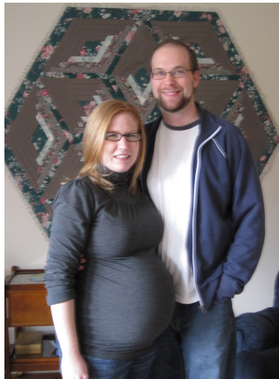
The new parents to be