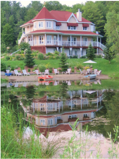
A lovely inn near Joilette, QC

We enjoyed the cafes and fromageries but failed to see a damn thing.