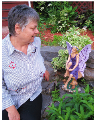
A wish is granted!