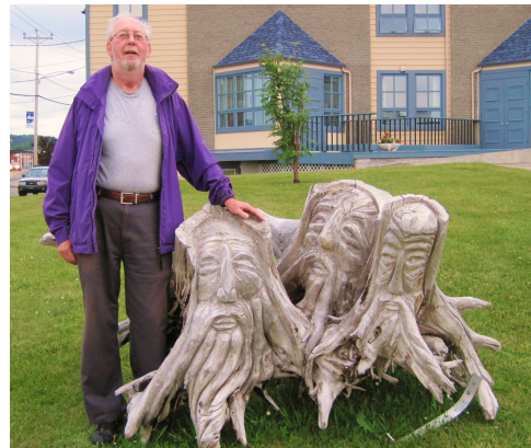
4 Old Geezers