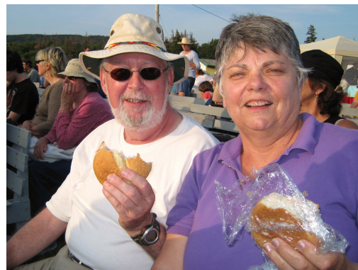
Celebrating our 40th at the Broad Cove Scottish Concert