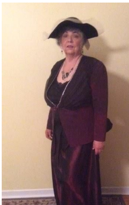
Hallowe'en 2017 Captain Highliner & The Duchess of Wallaceburg