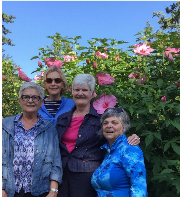
Harrow High Gr. 13 Graduation Reunion '17 @ Rock Garden @ RBG.